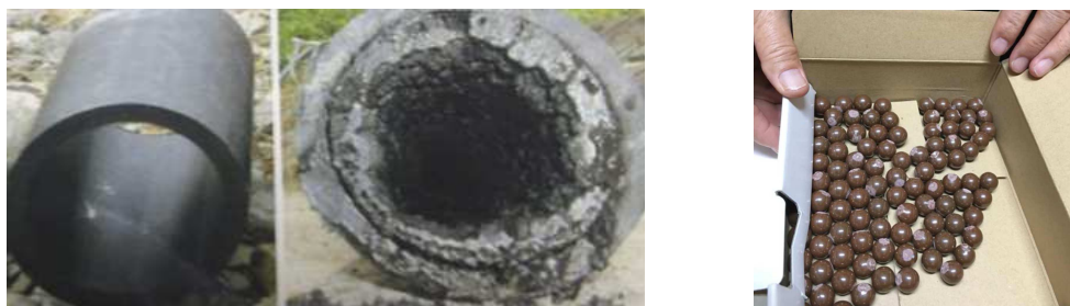
Figure 1: Unwanted effect of scale and the device studied here to cure it.